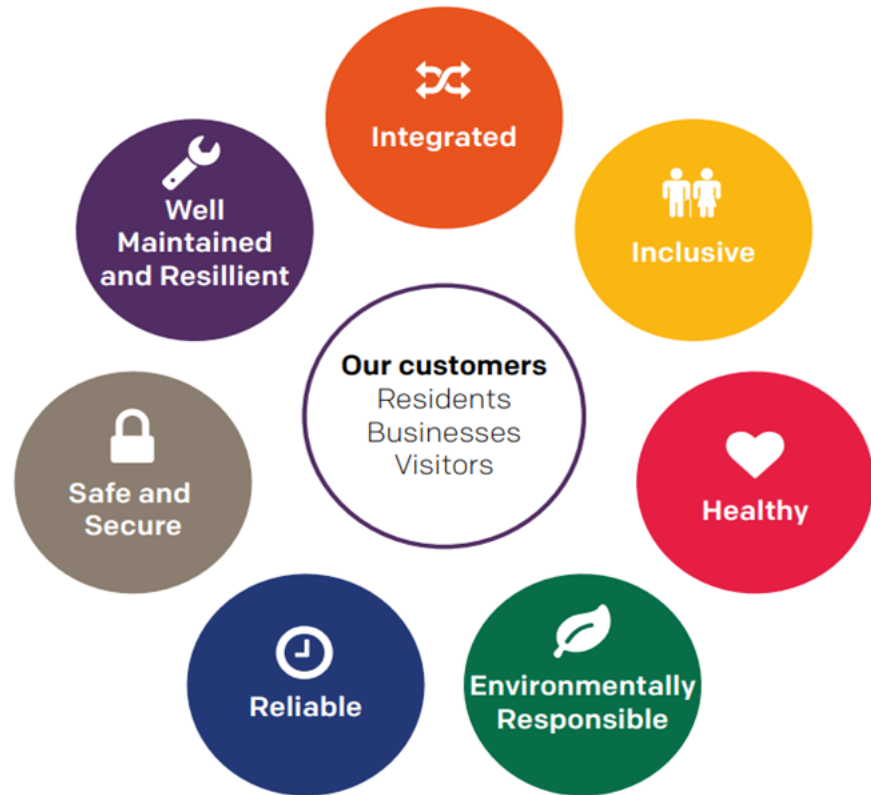
GM2040 – network principles